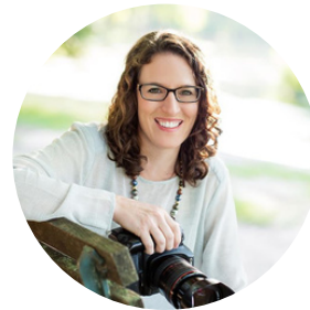
Amanda White ARWHITE PHOTOGRAPHY